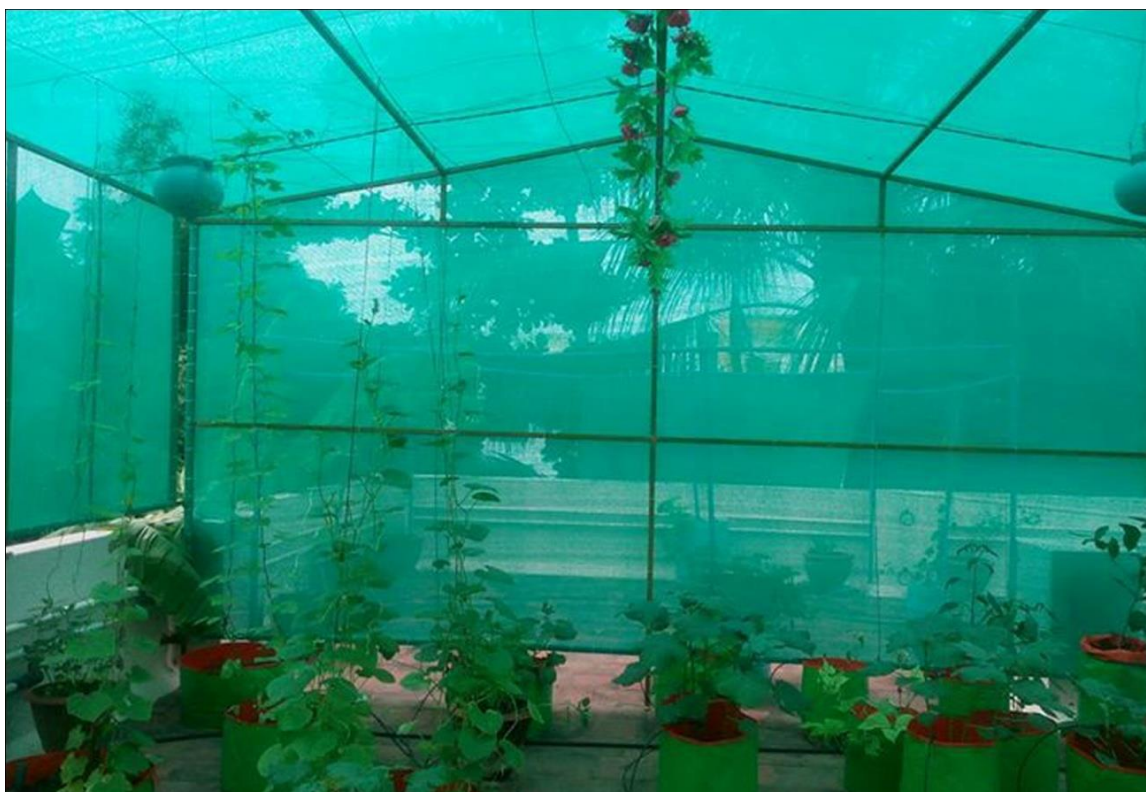
Photo of rooftop garden

Our vision to grow organic vegetables on every roof and to convert every building into a living green building, thus generating largest number of urban carbon credits in the world. We specialize in Rooftop gardening, Rooftop gardening of fruits, Rooftop Organic Farming kit, Organic Kitchen Gardening, Organic Balcony stands, Rooftop consultancy for organic farming, Medicinal Plants stand etc.