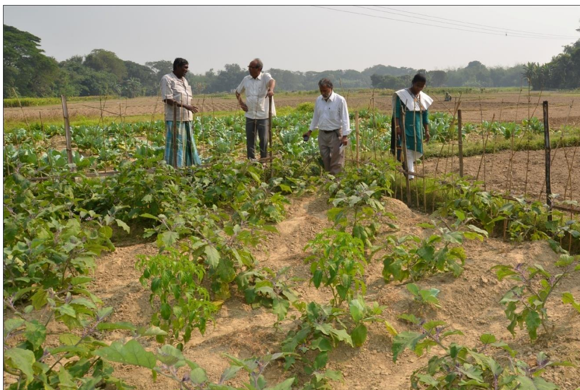
Photo of vegetable toxic free ecological farming at village & GP-Baksha, Chanditala-2 Block