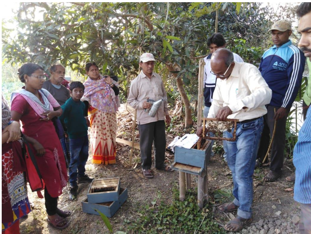
Photo of Training Program on Beekeeping at farm field village- Khragore , Chanditala-2 block, Districk- Hooghly