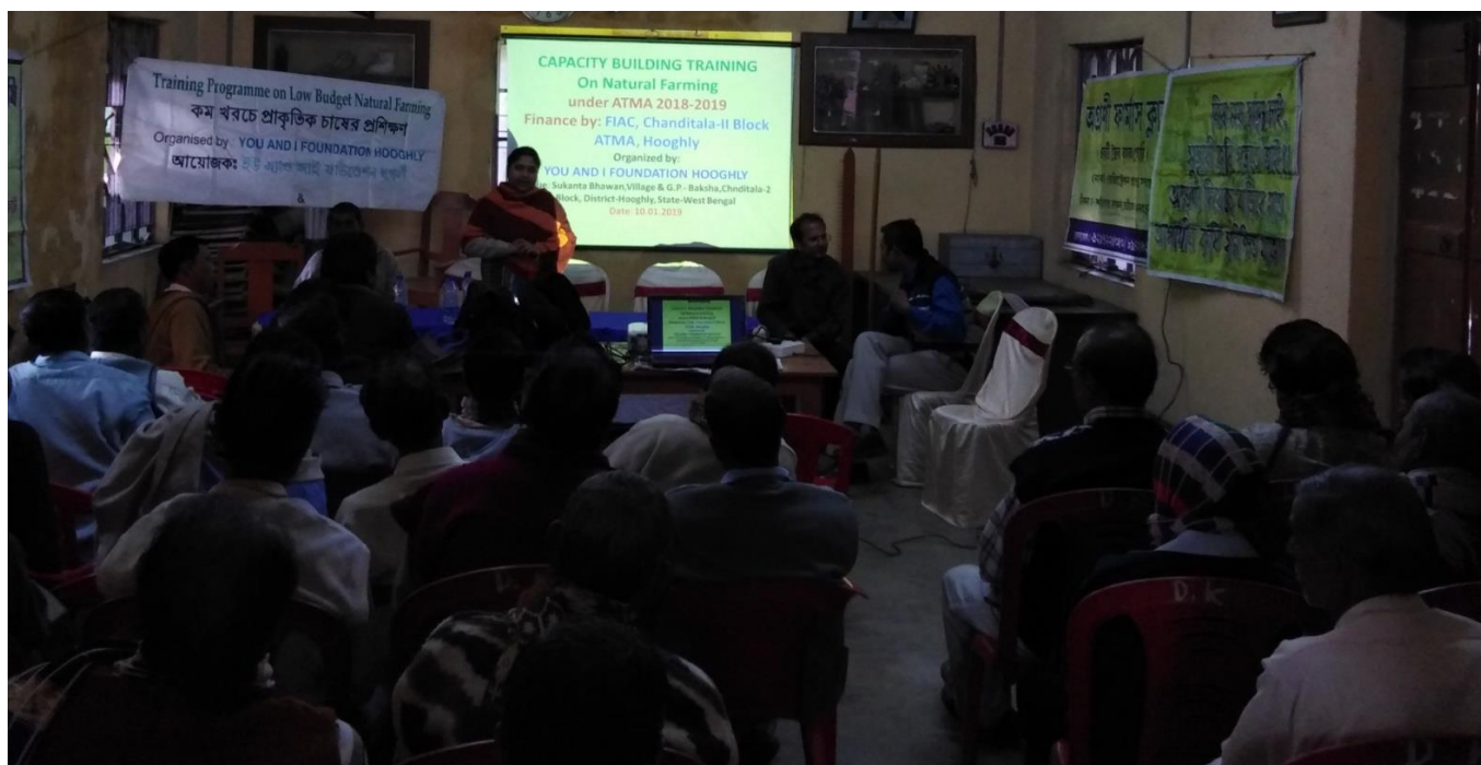
Photo of Capacity Building Training Program at Sukanta Bhawan , Village -Bakasha on 10.01.2019

YOU & I FOUNDATION HOOGLY have organized one day training program on " Capacity Building Training Program " on 10.01.2019 at 10 AM to 5 PM at sukanta bhawan village- baksha, Chanditala- 2 block, , District- Hooghly, West Bengal supported by ATMA, Department of Agriculture, Government of West Bengal.