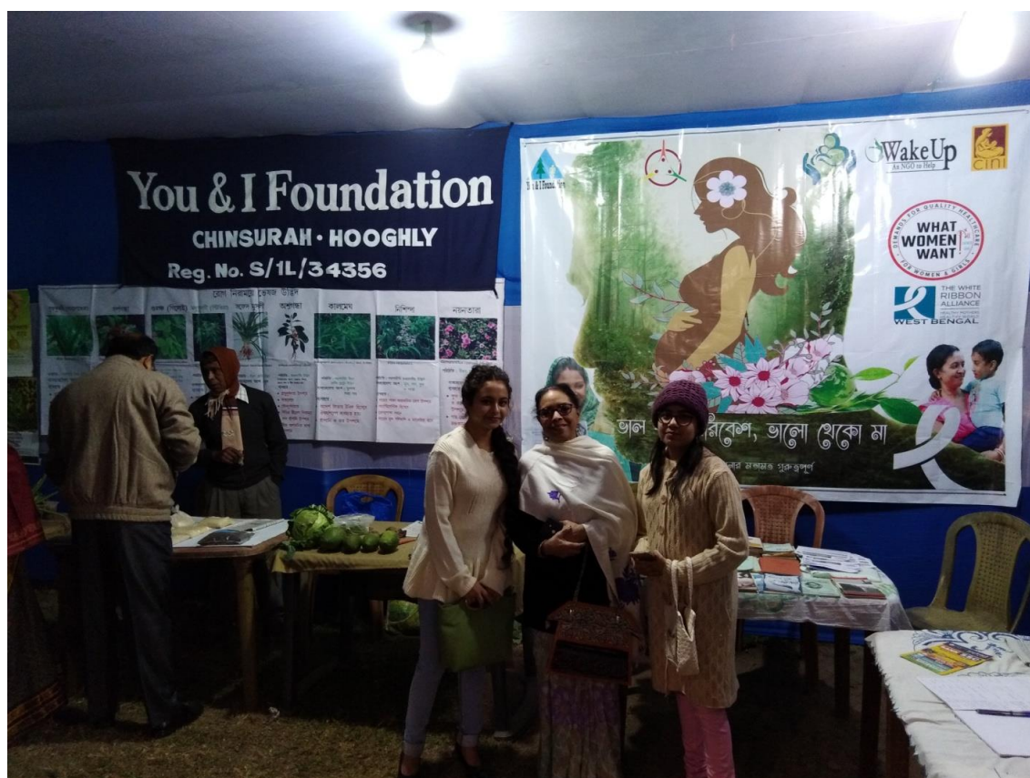
Stall at PARIBESH MELA, Chandannagore

We have participated in the 'Hooghly PARIBESH MELA' held in Chandannagore, from 22 th December 2018 to 26 th December 2018. A stall was erected with the main theme 'Medicinal Plant Conservation and uses' where we displayed different photographs of Medicinal Plant and its medicinal benefit to create mass awareness for preventive health care.