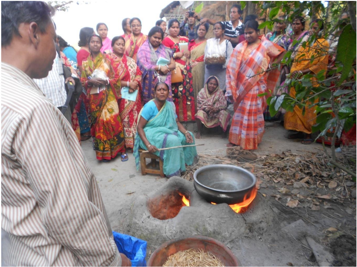
Photo of Training program on mushroom cultivation at Village- Khoragore, Chanditala-2 Block