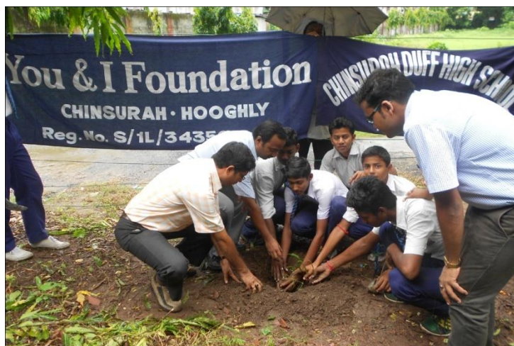
Photo of Tree Plantation at Chinsurah Duff High School during Forest Week– 2018

‘YOU AND I FOUNDATION HOOGHLY’ is a participant in ‘Billion Tree Campaign’ programme of United Nations Environment Programme (UNEP). We have planted 200 trees in and around Hooghly-Chinsurah. In this programme we have planted trees in three schools and one college namely, ‘Chinsurah Jyotishchandra Vidyapith’, ‘Dunlop Hindi High School’, ‘Chinsurah Duff High School & Hooghly Women’s College’. Enthusiastic students, teachers helped us to make this programme successful. This programme was observed during ‘Aronyo Saptaho(Forest Week) – 2018’ from 14-20 th July 2018.