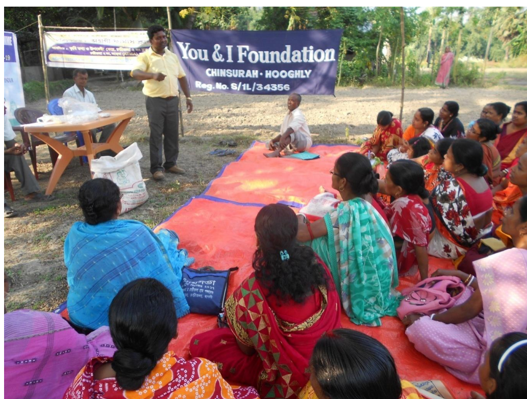
Photo of Training program on mushroom cultivation at Village- Khoragore, Chanditala-2 Block

YOU AND I FOUNDATION HOOGLHY has created a silent revolution transforming biodiversity and organic farming into an anti poverty strategy for small and marginal peasants. We have also brought biodiverse and unique toxic free agriculture products into consumption patterns through direct marketing of our toxic free agriculture products. Beginning with the year 2015, YOU AND I FOUNDATION HOOGLHY has started Toxic Free Agriculture Product Retail Center at Chandannagore in District Hooghly. We have connected biodiversity conservation with organic production.