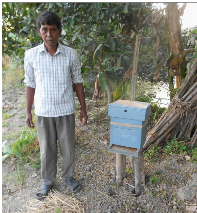
Photo of Beekeeping at farmers field village- Khragore , Chanditala-2 block, Districk- Hooghly